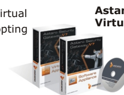
Astaro Software & Virtual Appliances