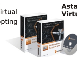
Astaro Software & Virtual Appliances