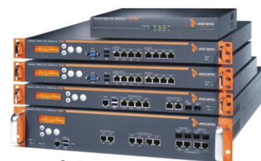
Astaro Hardware Appliances